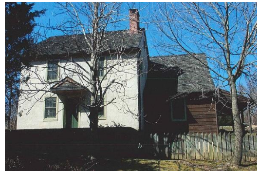
"Woodward/Wollerton House". Historic Resource #18, photograph from East Bradford Township Historical Commission files.