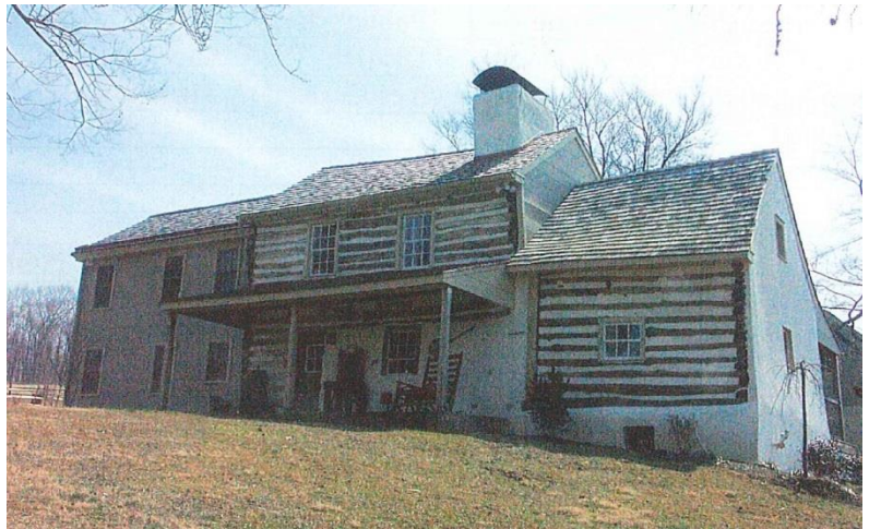
"Wollerton/Guthrie Farm". Historic Resource # 16