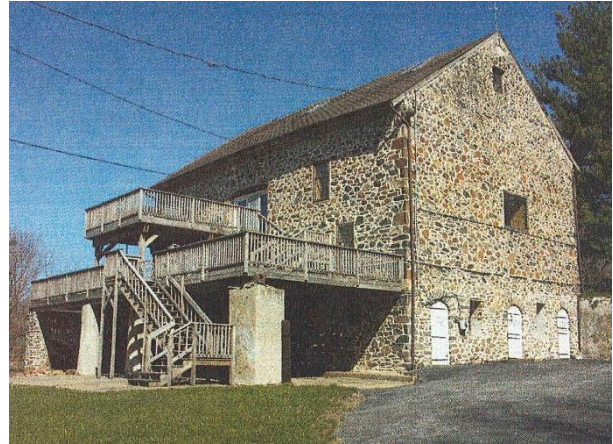
"Frank Barn". Historic Resource #56, photograph from East Bradford Township Historical Commission files